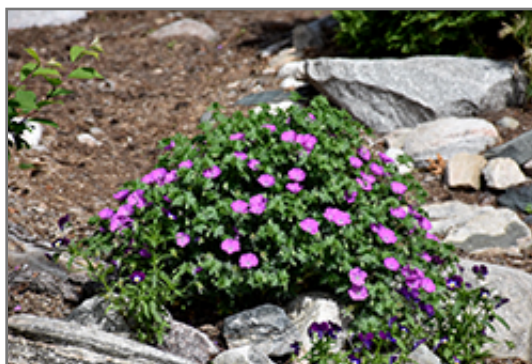
Bloody Cranesbill in bloom