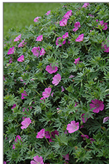
Bloody Cranesbill flowers