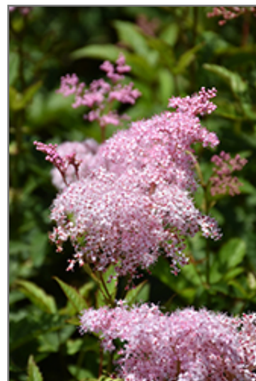
Queen Of The Prairie flowers