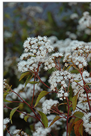
Chocolate Boneset flowers

Chocolate Boneset is recommended for the following landscape applications;