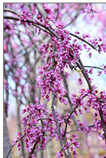
Pink Heartbreaker Redbud flowers

Pink Heartbreaker Redbud is recommended for the following landscape applications;