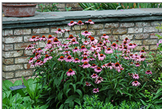
Magnus Coneflower in bloom