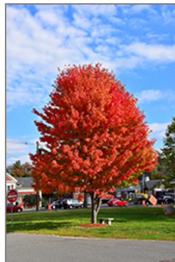
Autumn Splendor Sugar Maple in fall