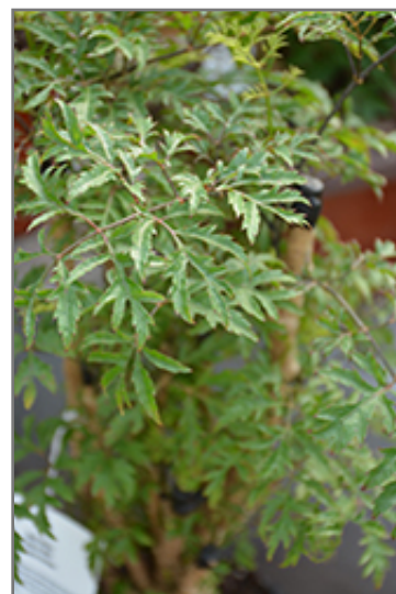
Ming Aralia foliage