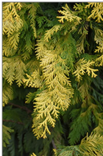
Cripps Gold Falsecypress foliage