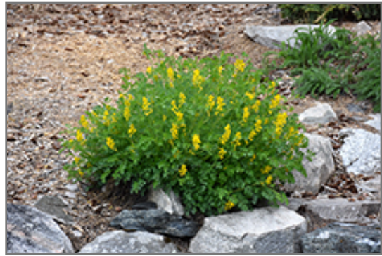
Golden Corydalis in bloom

Golden Corydalis will grow to be about 12 inches tall at maturity, with a spread of 12 inches. Its foliage tends to remain dense right to the ground, not requiring facer plants in front. It grows at a medium rate, and under ideal conditions can be expected to live for approximately 5 years. As an herbaceous perennial, this plant will usually die back to the crown each winter, and will regrow from the base each spring. Be careful not to disturb the crown in late winter when it may not be readily seen!