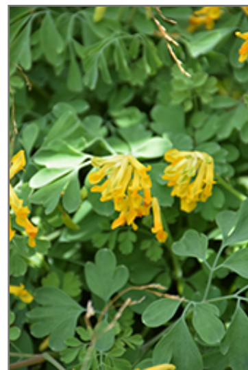
Golden Corydalis flowers