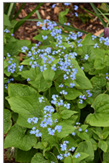
Siberian Bugloss flowers