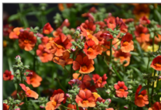
Sunsatia Blood Orange Nemesia flowers