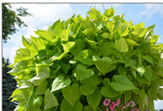
Sweet Caroline Sweetheart Lime Sweet Potato Vine