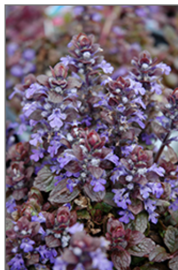
Bronze Beauty Bugleweed flowers

Bronze Beauty Bugleweed is recommended for the following landscape applications;