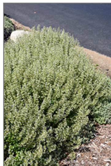
White Cloud Dwarf Calamint in bloom