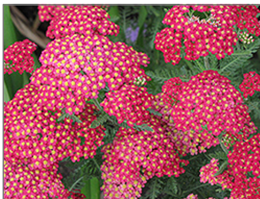
Galaxy Paprika Yarrow flowers

Galaxy Paprika Yarrow is recommended for the following landscape applications;