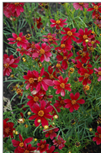
Red Satin Tickseed flowers