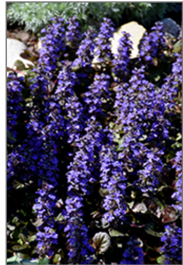
Mahogany Bugleweed flowers

This plant does best in partial shade to shade. It does best in average to evenly moist conditions, but will not tolerate standing water. It is not particular as to soil type or pH. It is somewhat tolerant of urban pollution. Consider covering it with a thick layer of mulch in winter to protect it in exposed locations or colder microclimates. This is a selected variety of a species not originally from North America. It can be propagated by division; however, as a cultivated variety, be aware that it may be subject to certain restrictions or prohibitions on propagation.