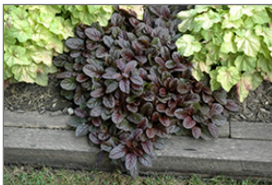
Mahogany Bugleweed