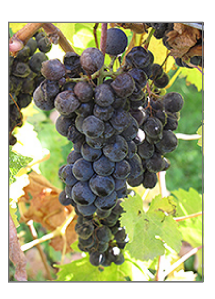
Cabernet Franc Grape fruit