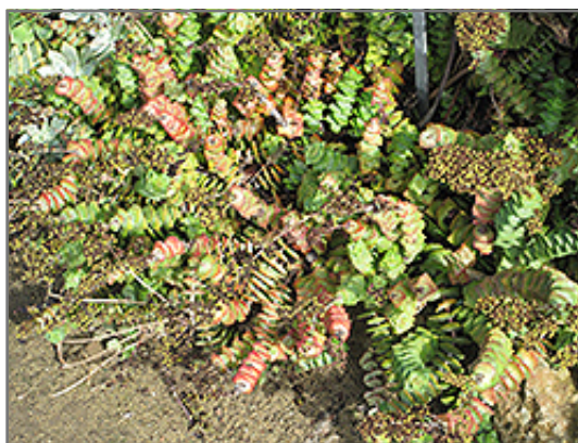
String Of Buttons

String Of Buttons is recommended for the following landscape applications;