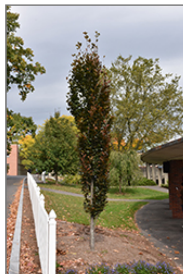
Dawyck Purple Beech