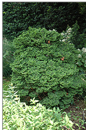
Koster's Falsecypress