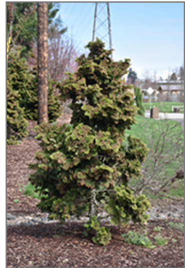
Koster's Falsecypress

Koster's Falsecypress makes a fine choice for the outdoor landscape, but it is also well-suited for use in outdoor pots and containers. Because of its height, it is often used as a 'thriller' in the 'spiller-thriller-filler' container combination; plant it near the center of the pot, surrounded by smaller plants and those that spill over the edges. It is even sizeable enough that it can be grown alone in a suitable container. Note that when grown in a container, it may not perform exactly as indicated on the tag - this is to be expected. Also note that when growing plants in outdoor containers and baskets, they may require more frequent waterings than they would in the yard or garden.