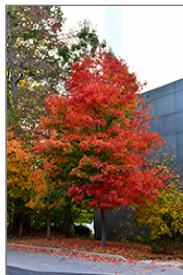
Fall Fiesta Sugar Maple in fall