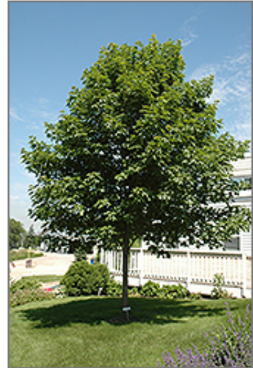
Fall Fiesta Sugar Maple

This tree should only be grown in full sunlight. It prefers to grow in average to moist conditions, and shouldn't be allowed to dry out. It is not particular as to soil pH, but grows best in rich soils. It is somewhat tolerant of urban pollution. This is a selection of a native North American species.