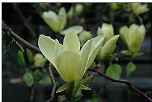
Golden Gift Magnolia flowers

Golden Gift Magnolia will grow to be about 25 feet tall at maturity, with a spread of 20 feet. It has a low canopy with a typical clearance of 2 feet from the ground, and is suitable for planting under power lines. It grows at a medium rate, and under ideal conditions can be expected to live for 50 years or more.