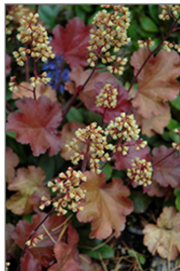
Little Cuties Blondie Coral Bells flowers

This is a relatively low maintenance plant, and should be cut back in late fall in preparation for winter. It is a good choice for attracting butterflies and hummingbirds to your yard. It has no significant negative characteristics.