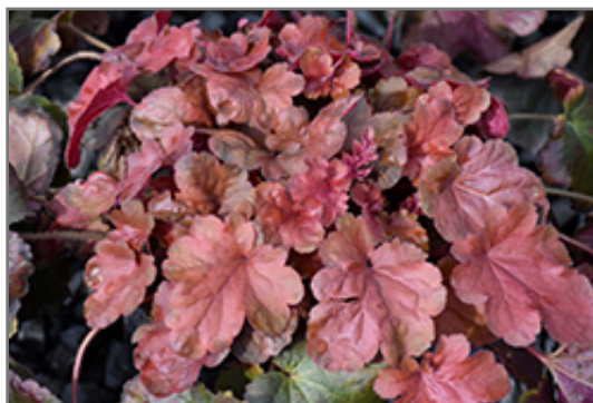
Little Cuties Blondie Coral Bells

Little Cuties Blondie Coral Bells is a fine choice for the garden, but it is also a good selection for planting in outdoor pots and containers. It is often used as a 'filler' in the 'spiller-thriller-filler' container combination, providing a mass of flowers and foliage against which the larger thriller plants stand out. Note that when growing plants in outdoor containers and baskets, they may require more frequent waterings than they would in the yard or garden.