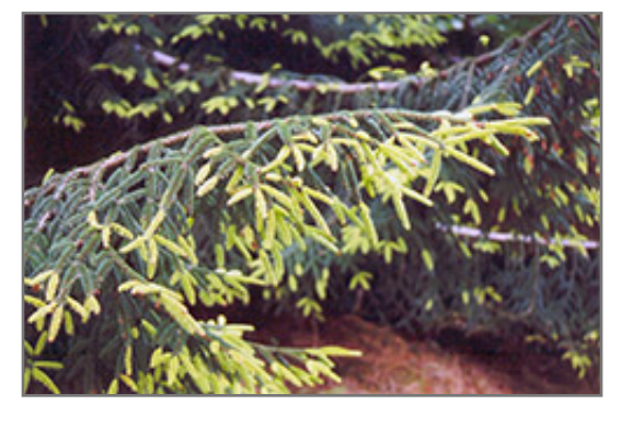
Golden Oriental Spruce foliage