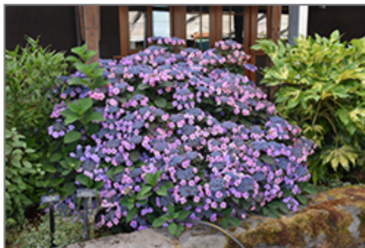
Tuff Stuff Hydrangea in bloom