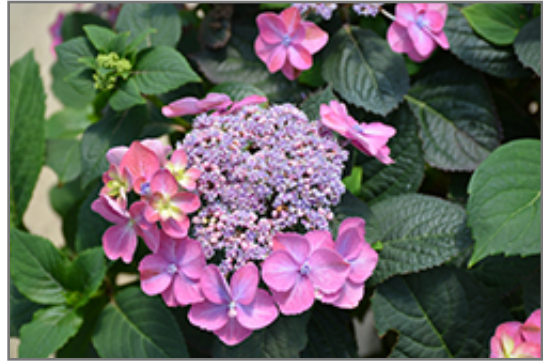
Tuff Stuff Hydrangea flowers

Tuff Stuff Hydrangea makes a fine choice for the outdoor landscape, but it is also well-suited for use in outdoor pots and containers. With its upright habit of growth, it is best suited for use as a 'thriller' in the 'spiller-thriller-filler' container combination; plant it near the center of the pot, surrounded by smaller plants and those that spill over the edges. It is even sizeable enough that it can be grown alone in a suitable container. Note that when grown in a container, it may not perform exactly as indicated on the tag - this is to be expected. Also note that when growing plants in outdoor containers and baskets, they may require more frequent waterings than they would in the yard or garden.