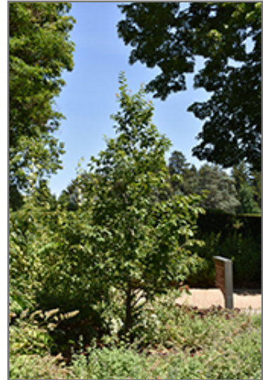
Firespire American Hornbeam

* This is a 'special order' plant - contact store for details