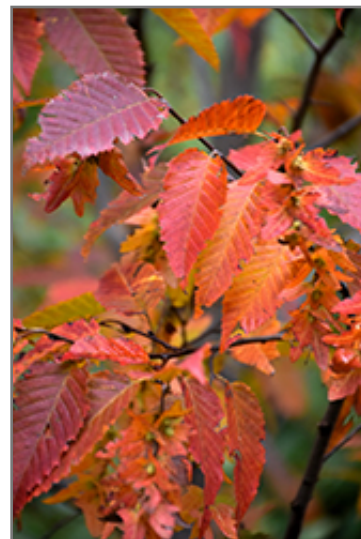
Firespire American Hornbeam in fall