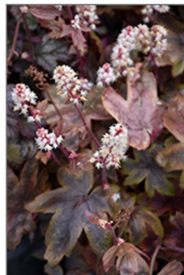
Brass Lantern Foamy Bells flowers