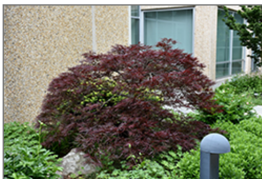
Red Dragon Japanese Maple

This is a relatively low maintenance tree, and should only be pruned in summer after the leaves have fully developed, as it may 'bleed' sap if pruned in late winter or early spring. It has no significant negative characteristics.