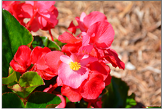
Whopper Rose Green Leaf Begonia flowers

This is a high maintenance plant that will require regular care and upkeep, and usually looks its best without pruning, although it will tolerate pruning. Deer don't particularly care for this plant and will usually leave it alone in favor of tastier treats. Gardeners should be aware of the following characteristic(s) that may warrant special consideration;