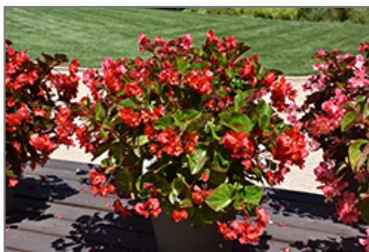
Whopper Red Green Leaf Begonia flowers