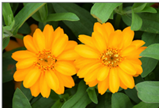
Profusion Double Golden Zinnia flowers