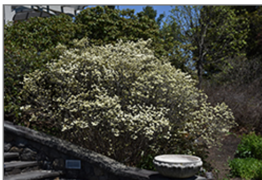
Dwarf Fothergilla in bloom

Dwarf Fothergilla is recommended for the following landscape applications;