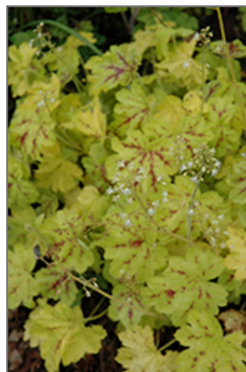
Solar Power Foamy Bells flowers