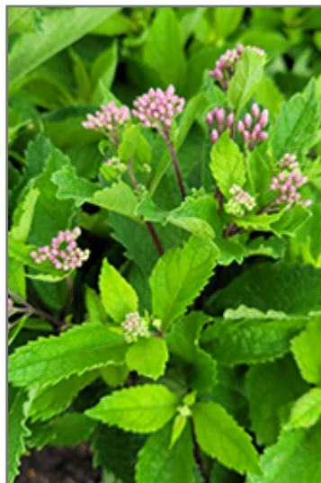
Phantom Joe Pye Weed flower buds