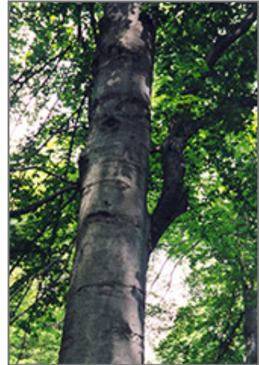
American Beech bark

This tree should only be grown in full sunlight. It requires an evenly moist well-drained soil for optimal growth, but will die in standing water. It is not particular as to soil pH, but grows best in rich soils. It is quite intolerant of urban pollution, therefore inner city or urban streetside plantings are best avoided, and will benefit from being planted in a relatively sheltered location. This species is native to parts of North America.