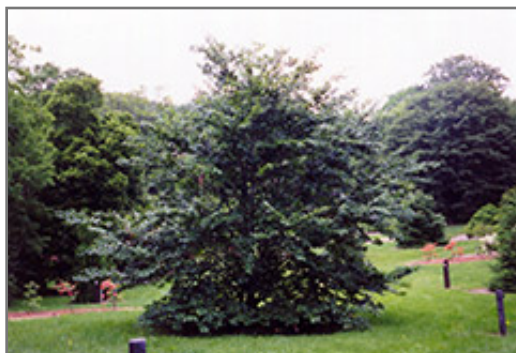
American Beech