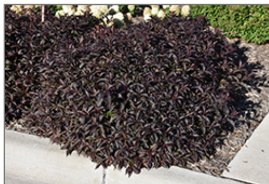
Spilled Wine Weigela