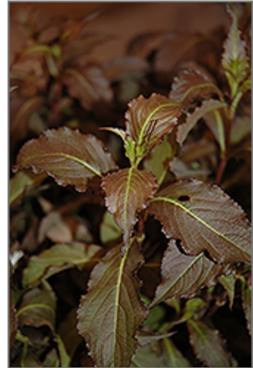
Spilled Wine Weigela foliage

Spilled Wine Weigela makes a fine choice for the outdoor landscape, but it is also well-suited for use in outdoor pots and containers. Because of its height, it is often used as a 'thriller' in the 'spiller-thriller-filler' container combination; plant it near the center of the pot, surrounded by smaller plants and those that spill over the edges. It is even sizeable enough that it can be grown alone in a suitable container. Note that when grown in a container, it may not perform exactly as indicated on the tag - this is to be expected. Also note that when growing plants in outdoor containers and baskets, they may require more frequent waterings than they would in the yard or garden.