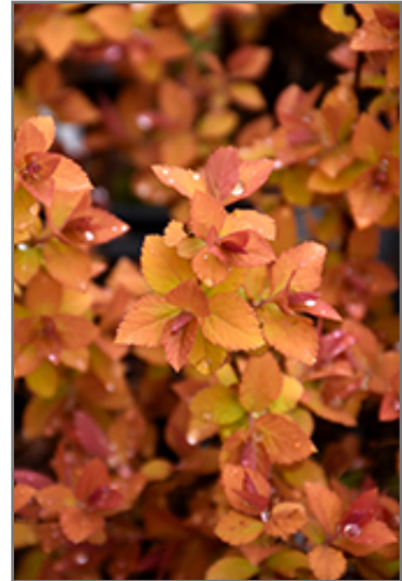
Double Play Big Bang Spirea foliage

* This is a 'special order' plant - contact store for details