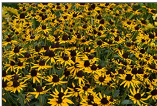
Little Goldstar Coneflower flowers