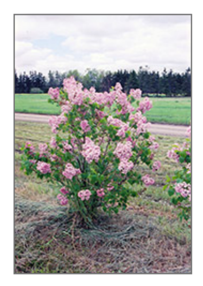
Maiden's Blush Lilac in bloom