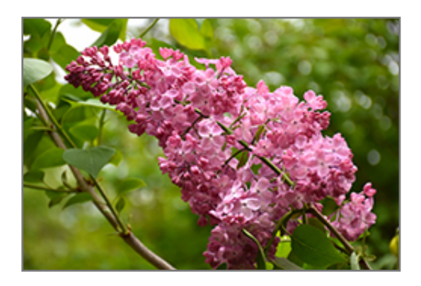
Maiden's Blush Lilac flowers

Maiden's Blush Lilac is recommended for the following landscape applications;