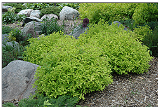
Goldmound Spirea