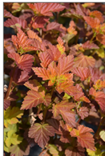
Amber Jubilee Ninebark foliage

This shrub will require occasional maintenance and upkeep, and can be pruned at anytime. It has no significant negative characteristics.