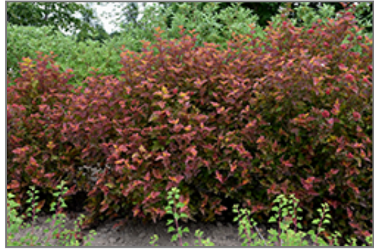
Amber Jubilee Ninebark

This shrub does best in full sun to partial shade. It is very adaptable to both dry and moist locations, and should do just fine under average home landscape conditions. It is not particular as to soil type or pH. It is highly tolerant of urban pollution and will even thrive in inner city environments. This is a selection of a native North American species.