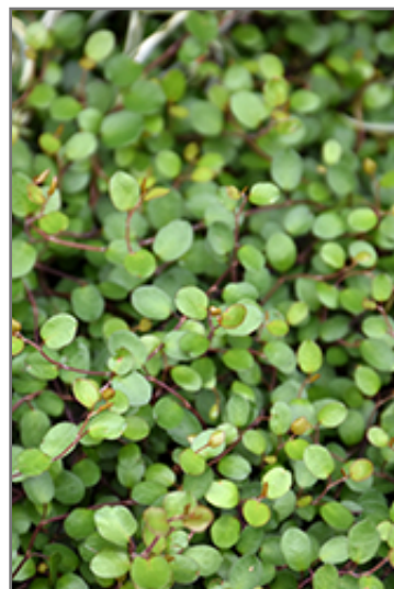
Creeping Wire Vine foliage