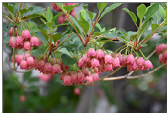
Redvein Enkianthus flowers