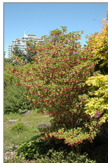
Redvein Enkianthus in bloom