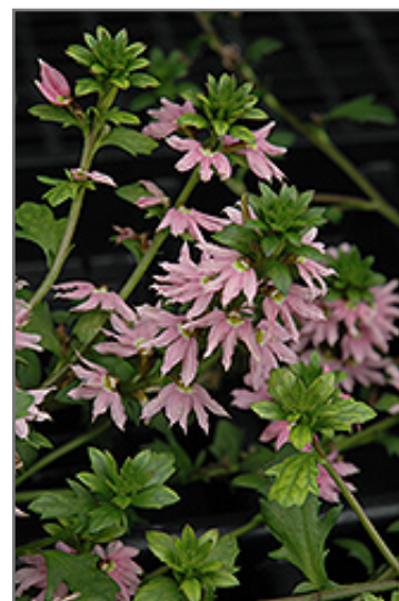
Bombay Pink Fan Flower flowers