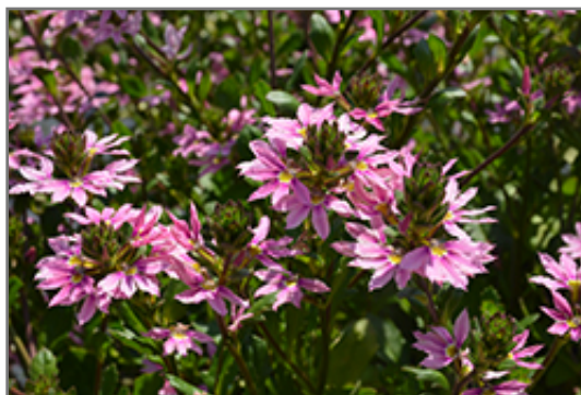
Bombay Pink Fan Flower flowers

Bombay Pink Fan Flower is recommended for the following landscape applications;