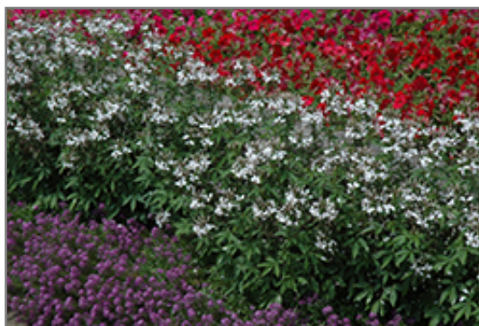
Senorita Blanca Spiderflower in bloom