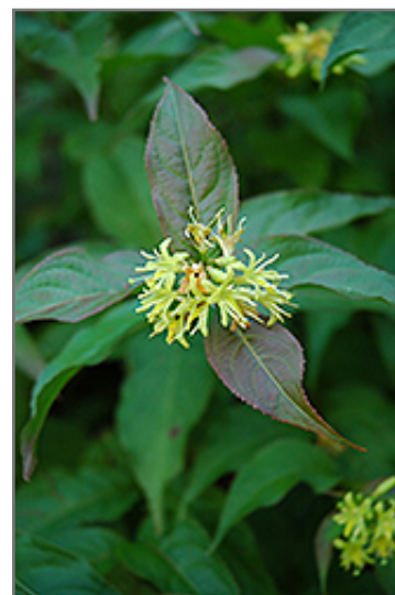
Bush Honeysuckle flowers