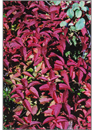
Bush Honeysuckle in fall

This shrub does best in full sun to partial shade. It is very adaptable to both dry and moist locations, and should do just fine under average home landscape conditions. It is not particular as to soil type or pH. It is highly tolerant of urban pollution and will even thrive in inner city environments. This species is native to parts of North America.