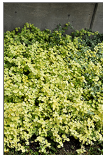
Lemon Licorice Plant