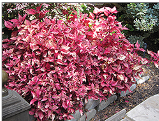
Blood Leaf