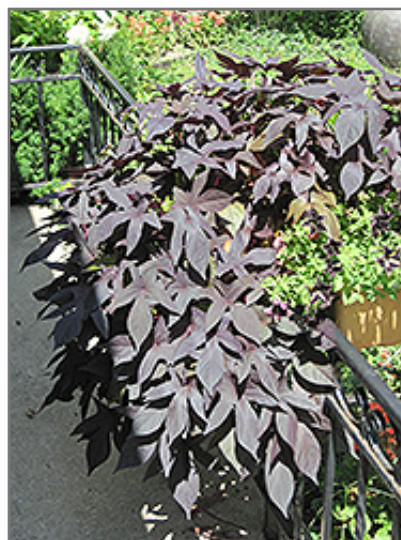
Proven Accents Blackie Sweet Potato Vine